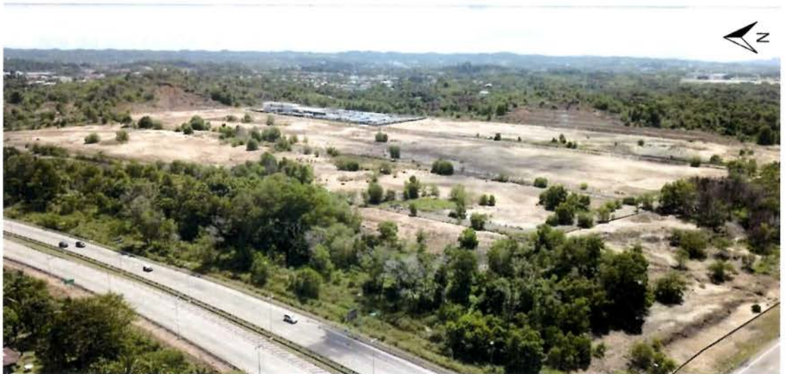
Figure 4: Aerial view from the north of the FTZ