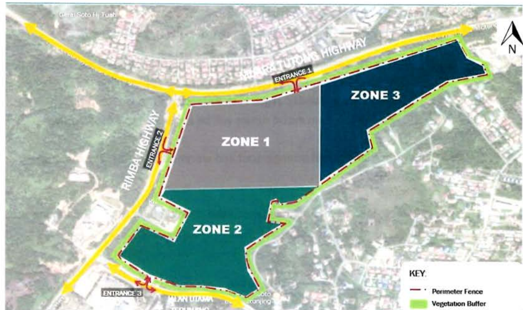
Figure 2: Boundary of Salambigar Industrial Park is illustrated by bold red line. Please refer to the link https://bit.ly/2r0SgSs to view the boundary on Google Maps